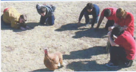
But NO one ignores this bird!

NO! No one ignores our beloved Turkey, shown being worshiped by ardent admirers. They plan to run "Turk, Turk" for President in 2012. After all, they postulate, we have elected other turkeys to public office.