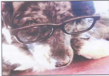
Lila takes her studies very seriously.

Nothing determines who we will become so much as those things we choose to ignore.